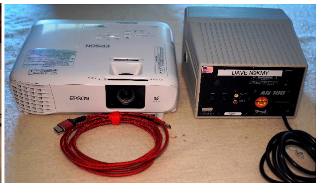
Projector and Powered Speaker