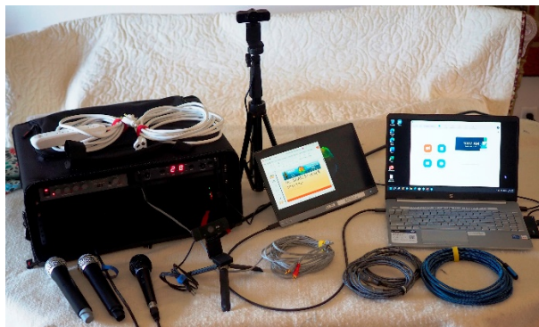
Gator Case, microphones, laptop and monitor.