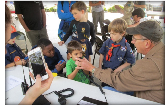
Annual Field Day Operations