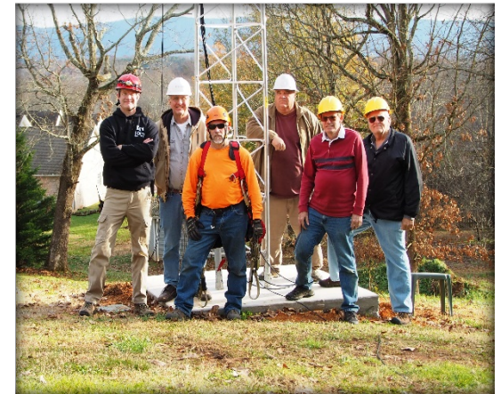
Hams Helping Hams